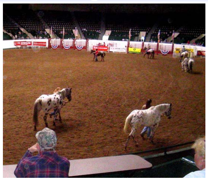
Inside the coliseum (pictured above) are all the Dream Maker horses.