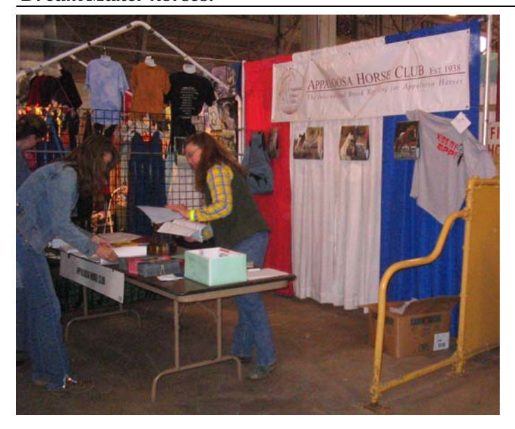
Editor's note: Back in the '80's, when I was still living in Illinois, I was a member of Indianhead ApHC for a few years.