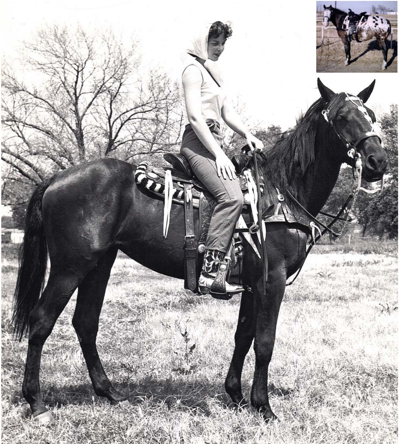
May 1959, Tulsa, Oklahoma.