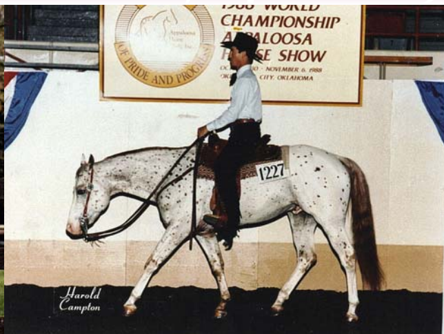
Bright Co Star. (at left and above) The above picture was taken at the 1988 World Show.