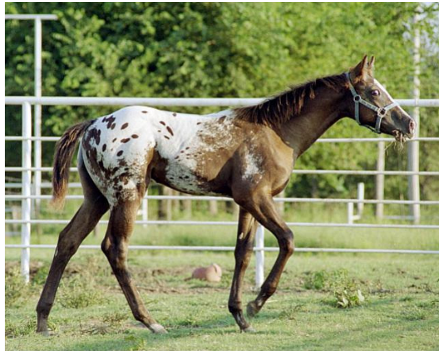
Hunting With Cheney (“Cheney”) The Hunter X Miss LBS Haz To Go

Watch for these two boys in the Yearling classes in 2008