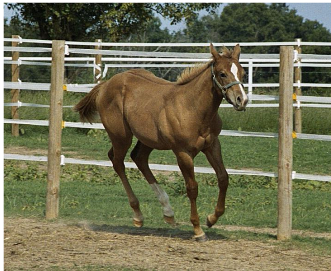
Your Zippers Open (“Ollie”) Impulsive Zipper X Chip Happens