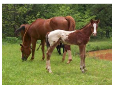
"Joker" - Blazin Hot Tip x Lynn's Last Detail colt, owned by Pam Meador