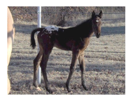
Kiss Me Silly - Joker (JC) x GW Champagne Palida filly, owned by Gentlewood Farms