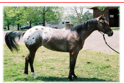
Blazin Hot Elegance 2004 Bay Mare Blazin Hot Tip x Just In M' Thoughts (by Go to Impress)

Blazin Hot Elegence is a very cute 2 year old mare that is showing tremendous potential as an all around horse. Ellie has had 60 days training and is very willing and aims to please! She's a pretty mover and has correct conformation with a pretty head, and a thin neck. She loads, clips, bathes and is current on all shots, wormings, coggins, and trims.