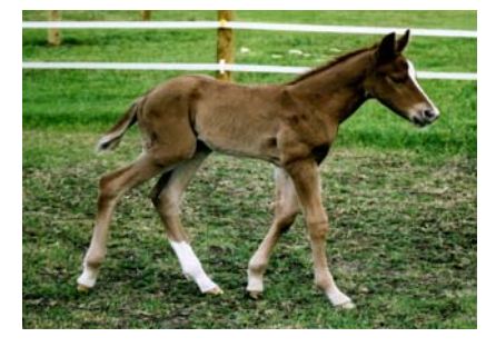
"Ollie" -- Impulsive Zipper x Chip Happens colt, owned by Gary Lukacik