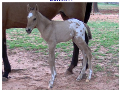
SomeAssemblyRequired - Passed away April 25 at 4 days old. Owned by Gentlewood Farms.