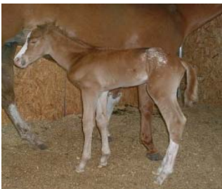
"Kid Cool" 2006 Colt owned by Lori Jumper Wild N Cool x Rub A Dub Kid Clue