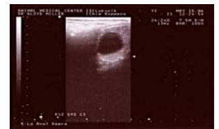
"Unknown" 2007 um...FILLY © owned by Gerry Lukacik Impulsive Zipper x Chip Happens