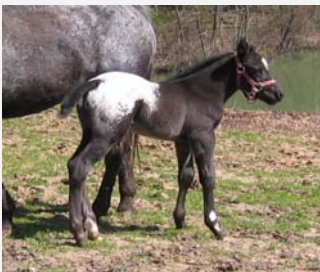
"Cutter" 2006 Black Colt owned by Shelia Kobs Obviously Magic x Sweet Ebony Image