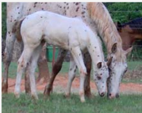
"Holiday" 2006 Filly owned by Gentlewood Farms Dial M For Moolah x Zipp O' Rhythm