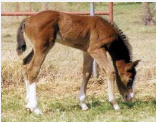
"Harley" 2006 Bay Characteristic Filly owned by Pam Meador Blazin Hot Tip x Lynns Last Detail (AQHA)