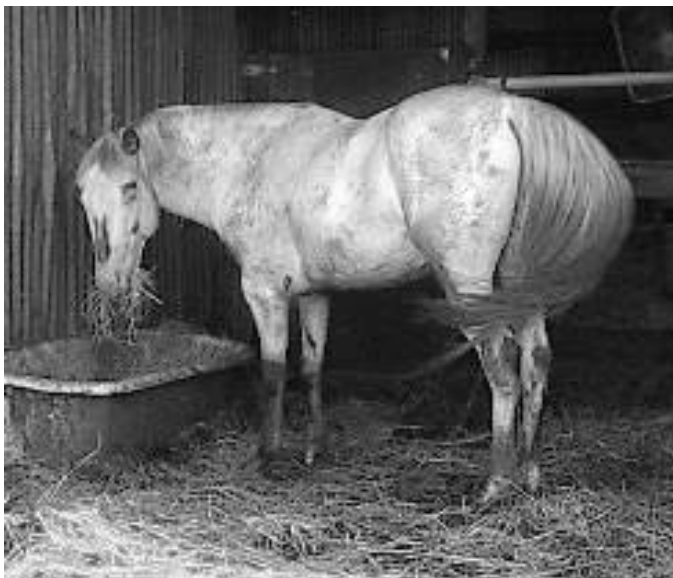
Ima CassColena, 1992 Bay Roan

Drawing will be held at the June 7, 2003, show — Tulsa Expo, Tulsa, OK