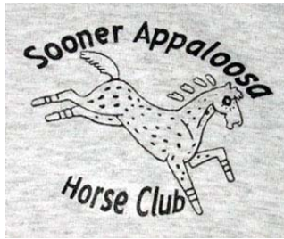
Close up of logo on shirt

Be "spotted" in our 2004 Tee that features the vintage Appaloosa logo! This ash gray Hanes Authentic is 99% cotton and comes in Adult sizes: Small, Medium, Large, X-Large ($12.00 ea) and XX-Large ($15.00 ea). Please include $5.00 for priority shipping and handling.