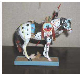
Pony of War