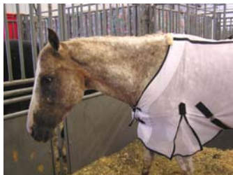
Dancer rests up while she waits to go home.