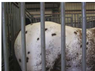
Lots of spots were seen at the show.