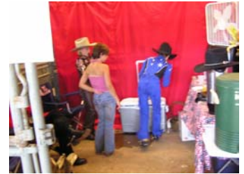
Exhibitors take a few minutes to watch one of the Appaloosa videos playing in the hospitality room.