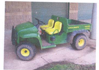
Our show manager, Dedra, got to drive a convertible all day long. Lucky gal!