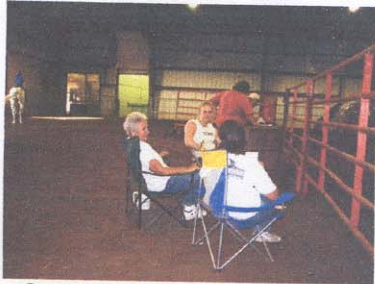
Sooner members chat while manning the gate.