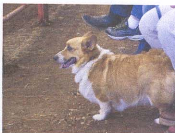
A spectator checks out the horses in the ring.