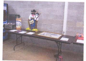
The silent auction had some really cool items.