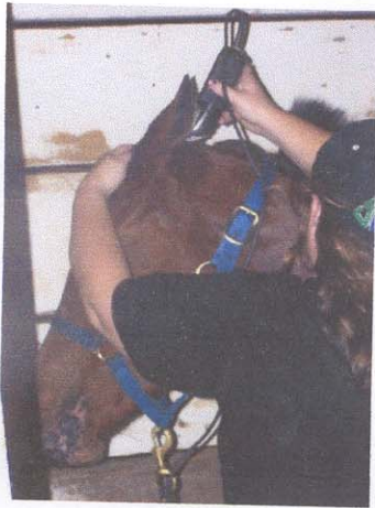
Don't look Einstein; Angie just might shave your whole mane off!

We made $188.05 in the June Silent Auction which will benefit the Sooner ApHC Youth Fund. Thanks to everyone who supported our youth by their donations and purchases.