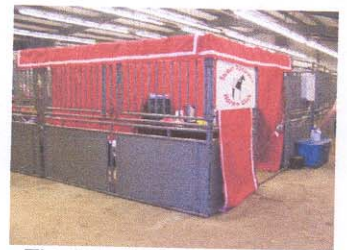
The hospitality booth was a hit again with exhibitors.