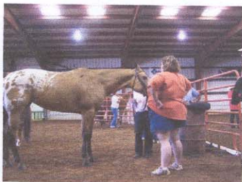
Exhibitors wait for their class and do last minute touch ups.